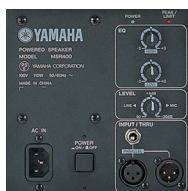
MSR400 Rear Panel