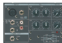
MSR250 Rear Panel

All-in-one sound solutions that are powerful, versatile, and reliable.