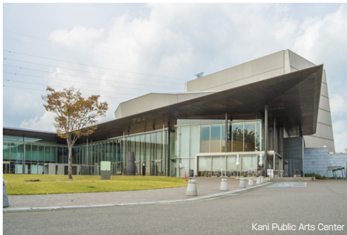
Kani Public Arts Center