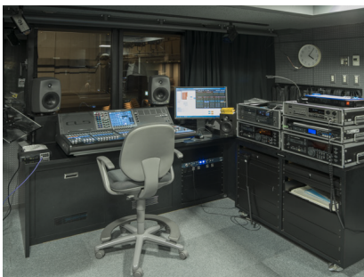
The audio control room at the Kani Public Arts Center small theater, featuring a Yamaha CL5 console