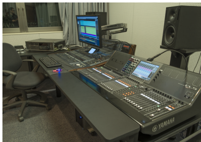
The mixing room with Yamaha CL5 and DM2000 consoles, a Steinberg Nuendo DAW, and more

can provide specific controls that the customer requests, and make changes whenever necessary.