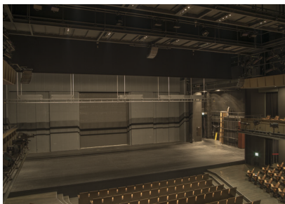
The Kani Public Arts Center small theater

directly connecting to a normal LAN, for example. For this particular installation we used category 5e STP cable made by Tachii Electric Wire Co., Ltd. The Tachii cable is of high quality and has excellent tensile strength, so we're confident that the network will be reliable. We are using Yamaha SWX2200 series network switches, but other general-purpose products could also be used.