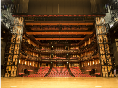
The Kani Public Arts Center main theater