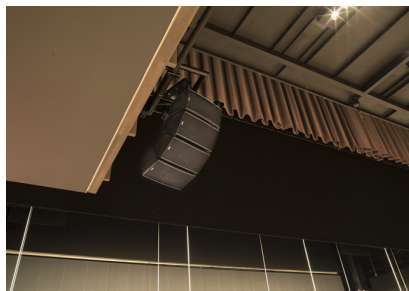
The main speakers at the Kani Public Arts Center small theater are NEXO GEO M6 units

Show: Personally, I am not particularly concerned about latency. We're careful to set up the system so that monitoring and wireless microphone latency is minimized, but we apply processing and delay to the house sound anyway, so it is not much of an issue.