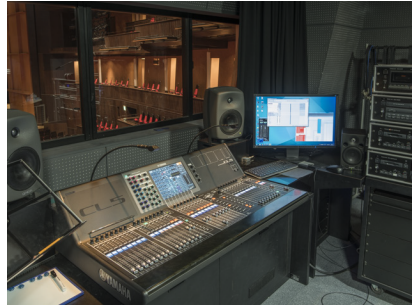
The audio control room at the Kani Public Arts Center main theater with its Yamaha CL5 main console

—— You mentioned that you considered all of the available network protocols, including CobraNet and EtherSound. What led to the final choice of Dante?