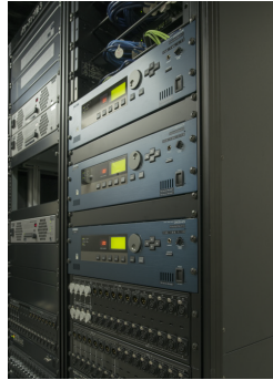
Three Yamaha DME64N units and three XMV8280-D amplifiers in the Kani Public Arts Center main theater amp room

Show: The AVBx7 can be fitted with up to seven interface cards. In addition to the Dante cards, we have also installed an AES card that allows connection to the PM1D or other console brought in from the outside.